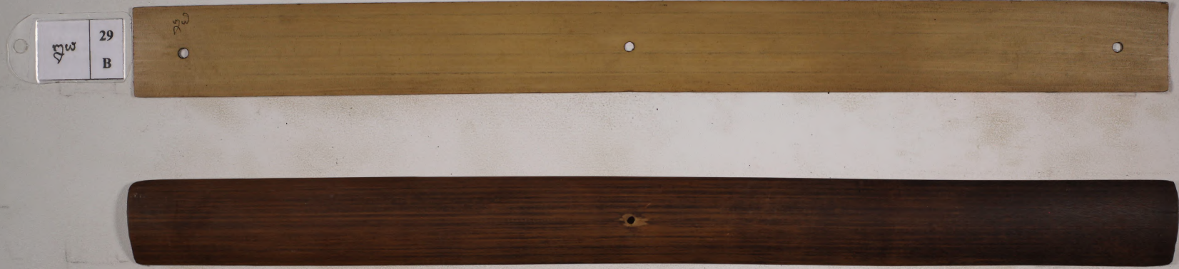
Pakem Gama Tirta 01 Pusat Dokumentasi Dinas Kebudayaan Provinsi Bali ~ Indonesia